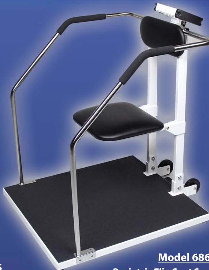
Model 6868 Bariatric Flip Seat Scale 800 lb x .2 lb / 300 kg x .1 kg