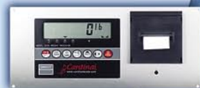
Digital readout with paper tape printer

DETECTO MANUFACTURES A FULL LINE OF MEDICAL PRODUCTS